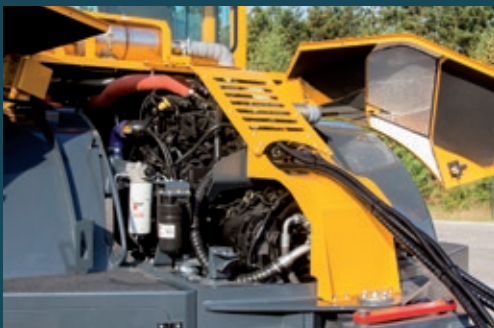
Good access to all maintenance points with the patented hood system.