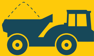
Conventional compact tipper