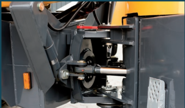
Articulated swivel joint with stabilization cylinder.