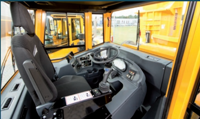
Cabin with optional swivel console and intuitive operability.